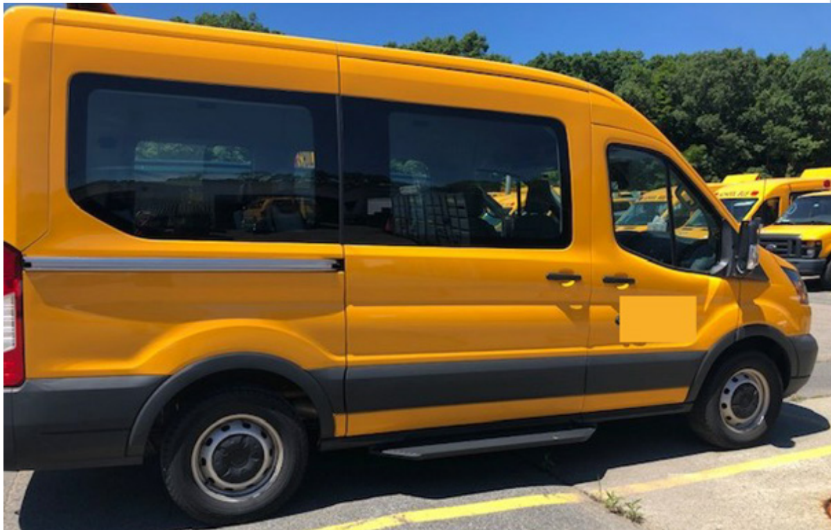
Figure 1: Examples of 7D Vehicles