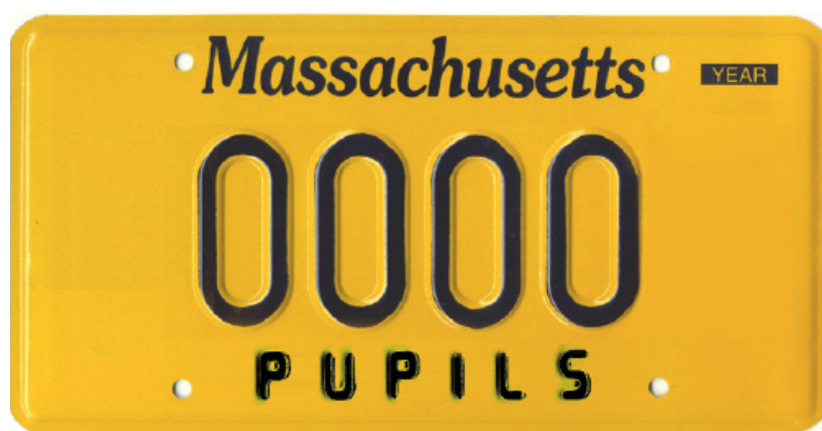
Figure 3: Sample 7D Pupil Plate